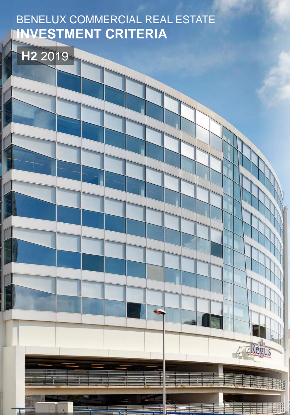
The Bridge, The Hague