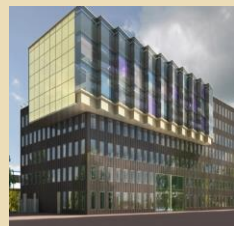
TOMTOM HQ, AMSTERDAM