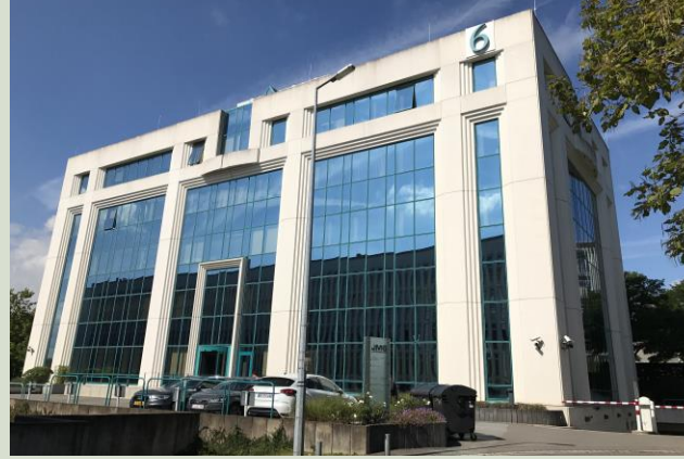
RUE JEAN MONNET 6, LUXEMBOURG