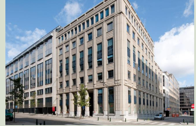
RUE MONTOYER 40, BRUSSELS