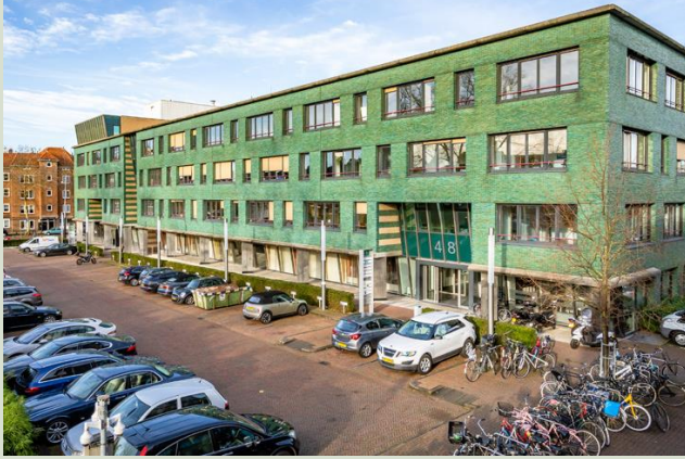
EMERALD HOUSE, AMSTERDAM