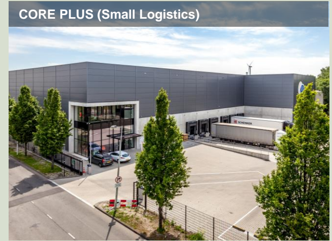
CORE PLUS (Small Logistics)

Core light industrial portfolio of 5 fully let assets