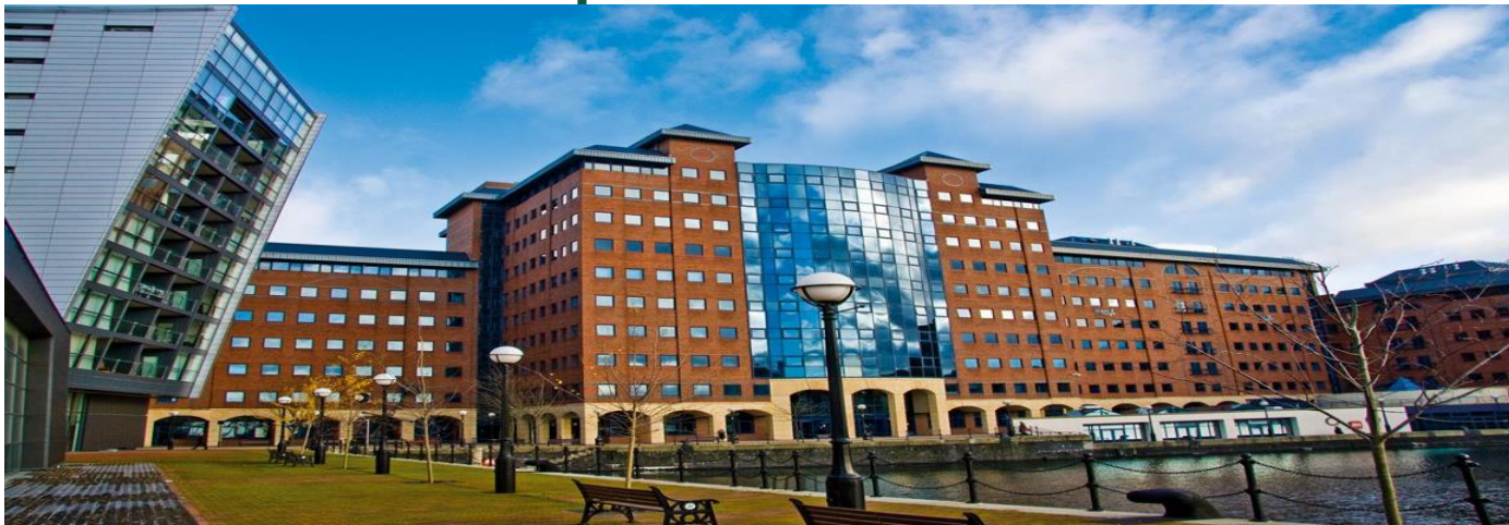
Anchorage, Salford Quays